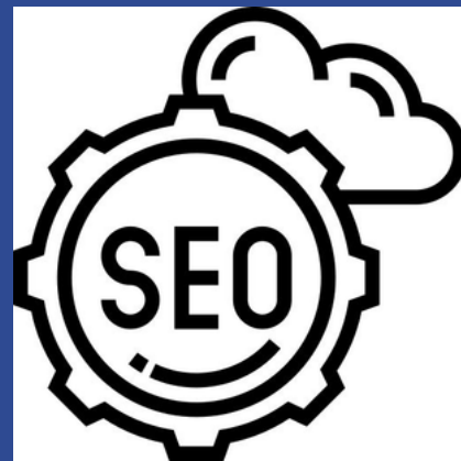
Search Engine Optimization (SEO)