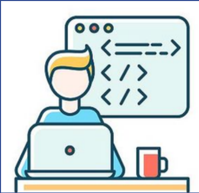
Custom Software Development